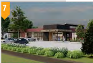
7 OPEN Marczyk Fine Foods 8k s.f. retail