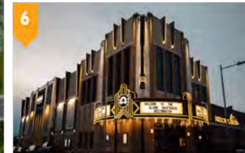
6 OPEN Alamo Drafthouse 9-screen theater/restaurant