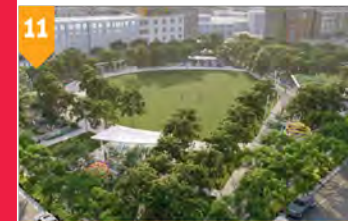
11 OPENING Q2 2025 Center Park 2.9 acres