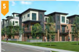
5 OPEN Townhomes on Harlan 34-townhomes