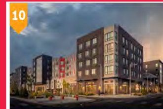
10 OPEN 8877 Eaton 118 units/27k s.f. retail