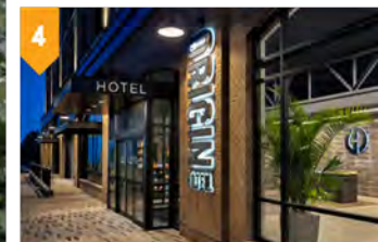
4 OPEN Origin Hotel 125-room boutique hotel/15k s.f. retail