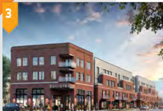
3 FUTURE TOWNHOMES & CONDOMINIUMS Downtown Westminister Residences