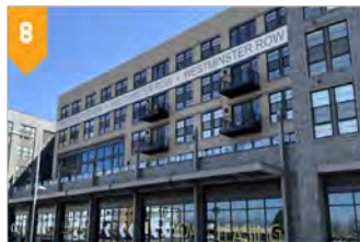
8 OPEN Westminister Row 274 units/17k s.f. retail