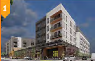
1 OPENING Q4 2025 VH Vertikal, LLC 200 Active Adult Units/15k s.f. retail