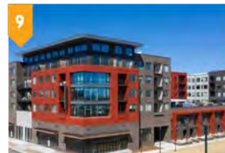
9 OPEN Ascent Westminister 255 units/22k s.f. retail