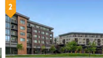
2 OPEN Aspire Westminister 226 units/38k s.f. retail